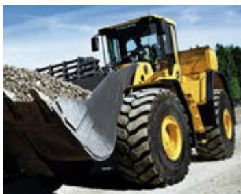
Volvo Construction Equipment